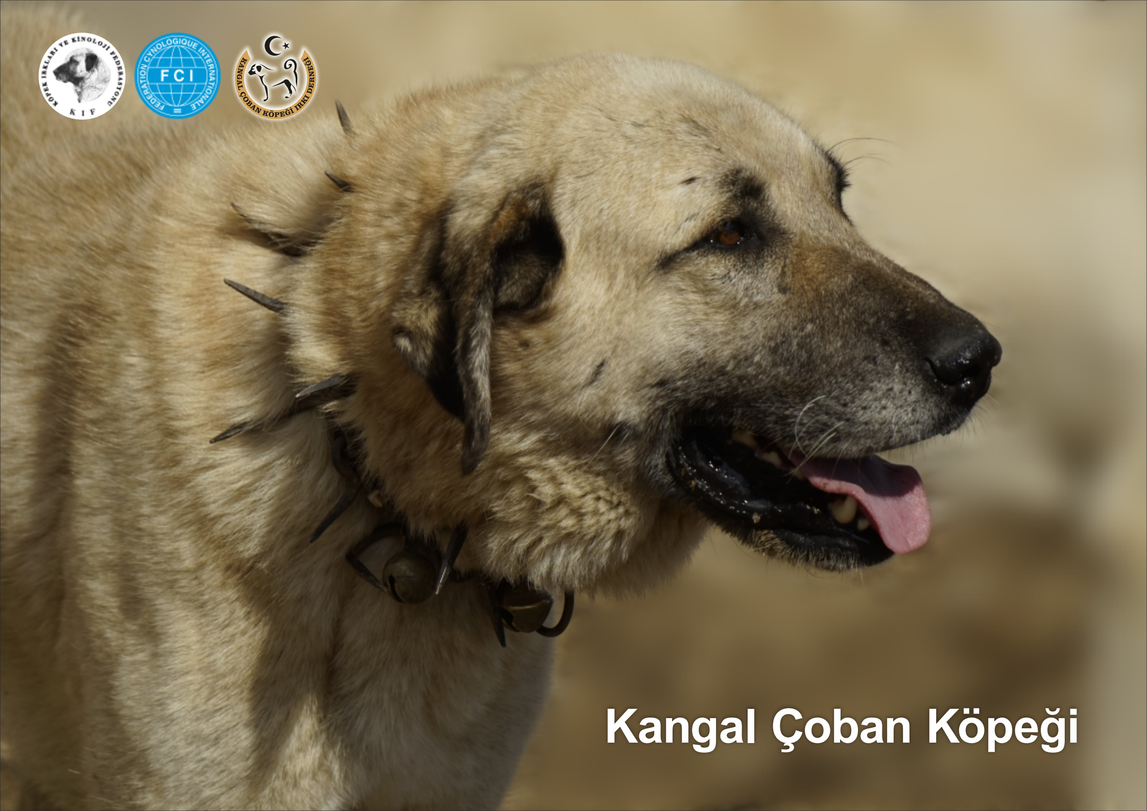
Kangal Çoban Köpeği