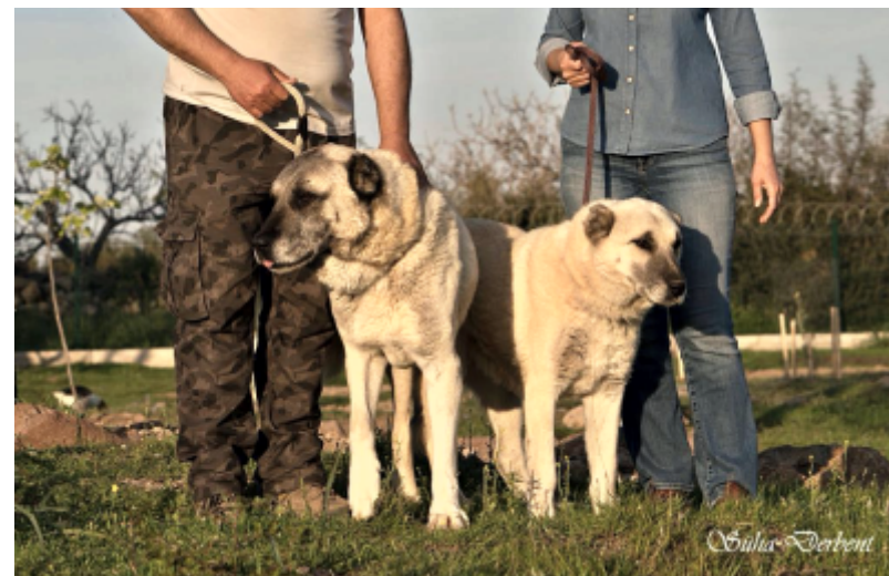
10 and 7 Years